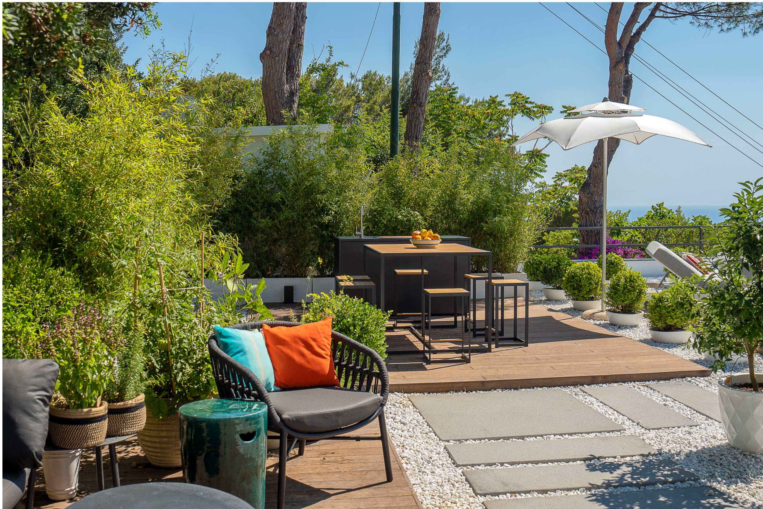
The rooftop terrace has a surface area of 1830 sq. ft. and it offers sunbeds, sofas, cocktail bar and a little garden of fresh herbs