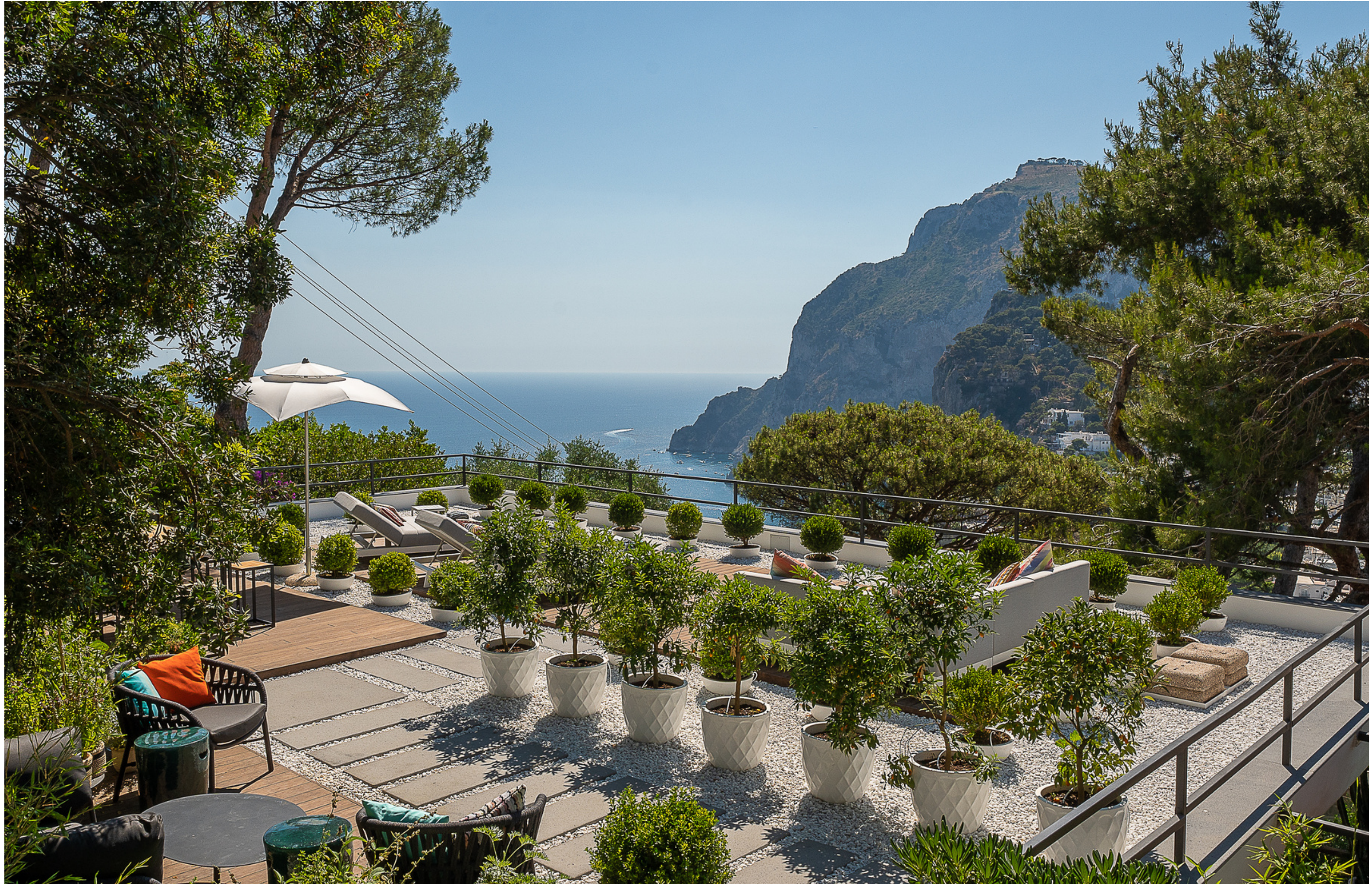
the roof terrace