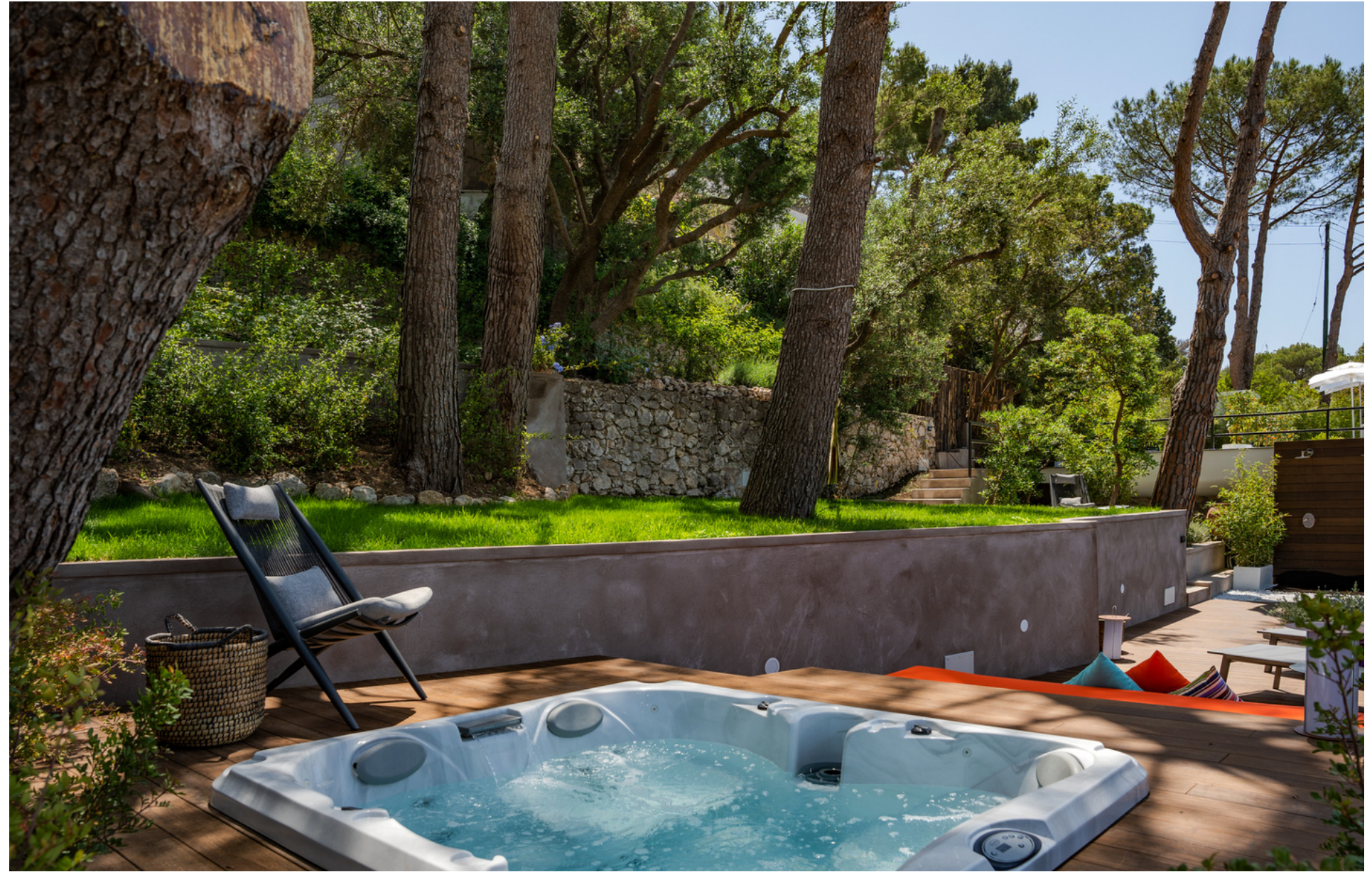
Shaded by mediterranean pine and olive trees